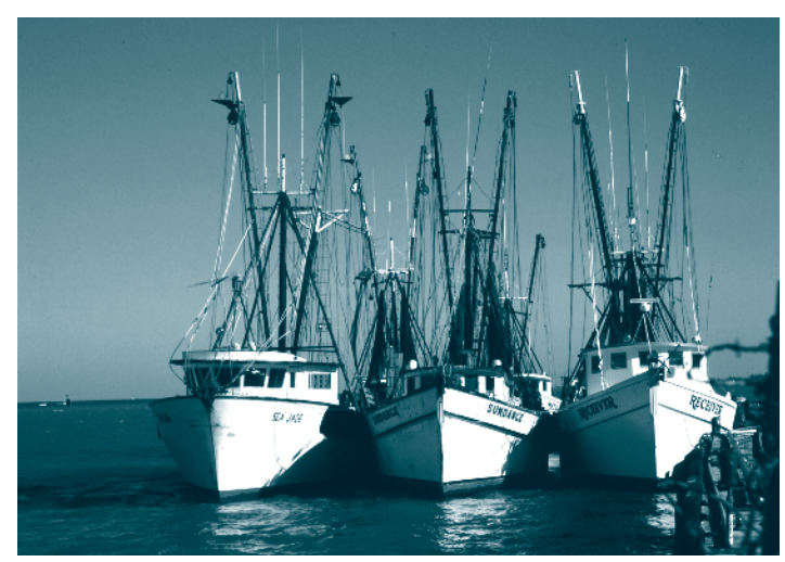
Three shrimp boats at the Municipal Pier in Key West, Florida

Commercially-important species and species groups in the Gulf of Mexico include: blue crab, stone crab, crawfish, groupers, menhaden, mullets, oyster, shrimp, red snapper, and tunas.