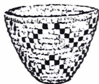
CONFEDERATED TRIBES OF THE CHEHALIS RESERVATION P.O. BOX 536 OAKVILLE, WA 98568 (360) 273-5911 753-3213