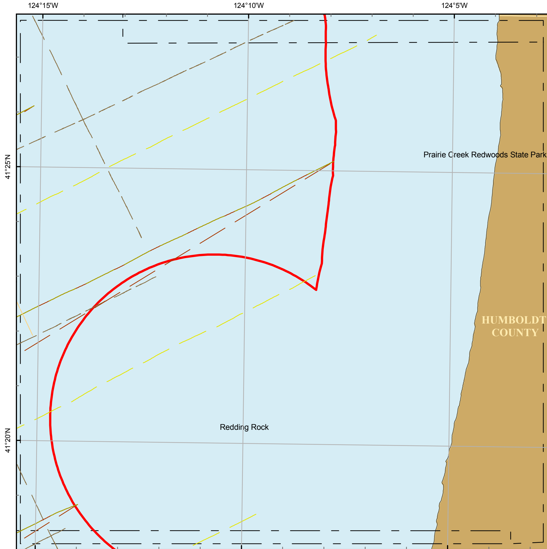
Projection: UTM Zone 10 Datum: WGS84 Map Scale: 1:75,000