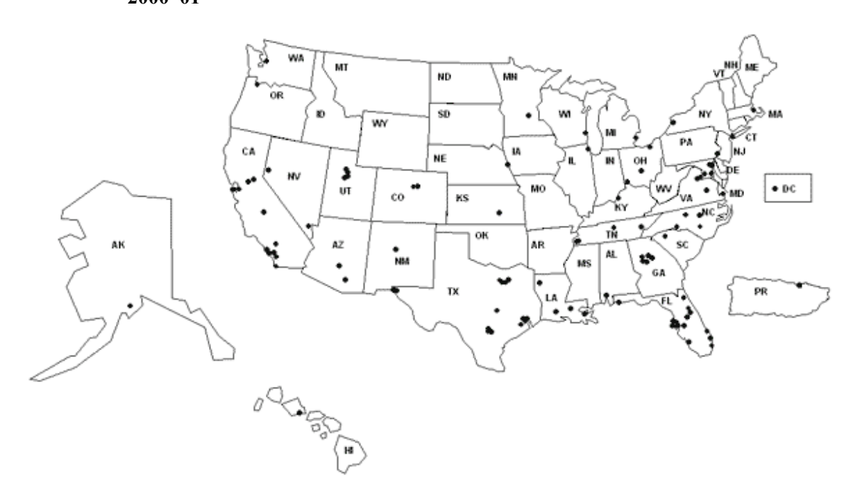
Figure 1.—The 100 largest school districts in the United States and jurisdictions: School year 2000-01

NOTE: The universe for this figure includes outlying areas, Bureau of Indian Affairs, and Department of Defense (overseas) schools. The markings on the map denote the approximate location of the school district. The District of Columbia, Hawaii, and Puerto Rico are all one-district jurisdictions.