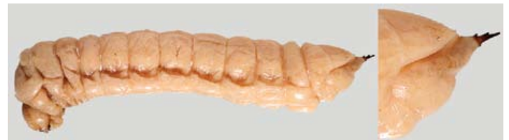
Figure 3. Sirex noctilio —larva and close-up of posterior spine.