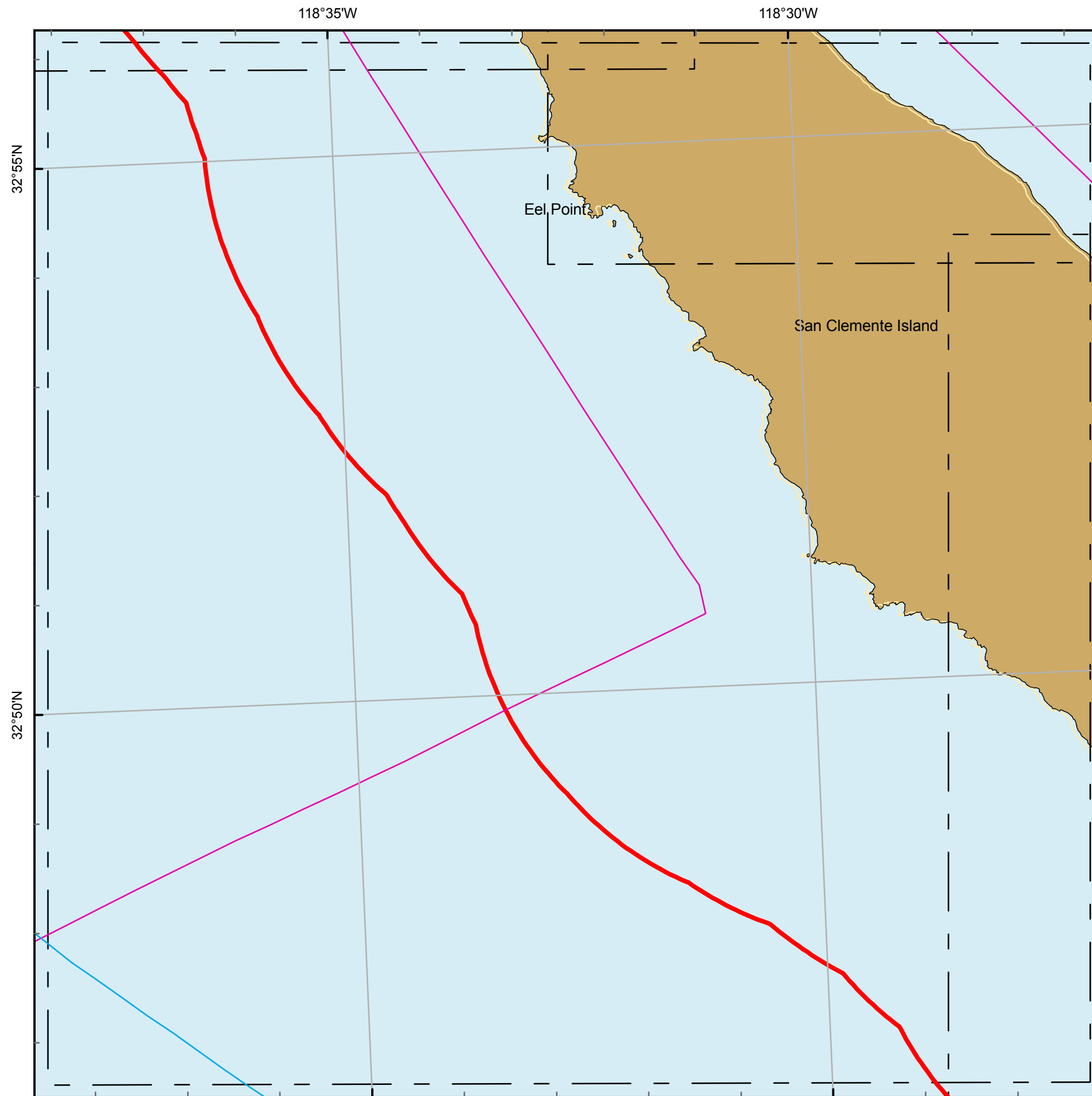
Projection: UTM Zone 10 Datum: WGS84 Map Scale: 1:75,000