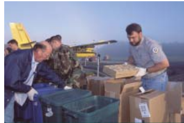
Figure 3—WS personnel and cooperators prepare for aerial ORV bait distribution.

WS contributions to ORV include providing cooperative Federal funding that enhances States' ability to develop and implement more effective, far-reaching, and comprehensive rabies education, control, and prevention programs. WS also ensures that project evaluations are vigorous and science based for sound project implementation.