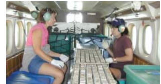
Figure 4—Planes are the most effective means for distributing the baits over large-scale ORV zones.

The fishmeal is attractive to raccoons and strong enough to withstand distribution from airplanes flying at an altitude of about 500 feet. When a raccoon finds the bait and bites into it, the sachet ruptures, allowing the vaccine to flow into the raccoon's mouth. Raccoons become vaccinated against rabies by this oral route.