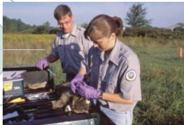
Figure 2—Biologists collect blood and other biological samples to evaluate the effectiveness of the ORV program before releasing the animals back into the wild at the site of capture.

Since 1992, WS has partnered with the Vermont Departments of Health, Agriculture, and Fish and Wildlife to manage a toll-free telephone hotline to help Vermont residents cope with raccoon, fox, and bat rabies, which continues to threaten humans and animals there. Over