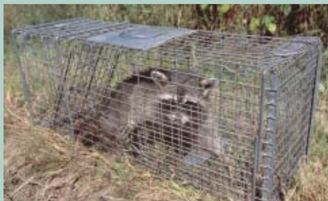
Figure 6—Raccoons are lured to live traps using marshmallows, oil of anise, vanilla, and other attractants.

In Ohio, where the cooperative ORV program has been in place since 1997, approximately 34 percent of all raccoons tested have protective antibodies to rabies. This vaccination rate appears to be sufficient to prevent the spread of the disease across the rabies-free barrier. Ohio has seen a dramatic drop in the number of cases of raccoon rabies since the program began. In 1997, Ohio reported 59 rabies-positive raccoons, but in 2000 none were reported. In 2001, Ohio documented only one case of raccoon rabies along its eastern border with Pennsylvania.