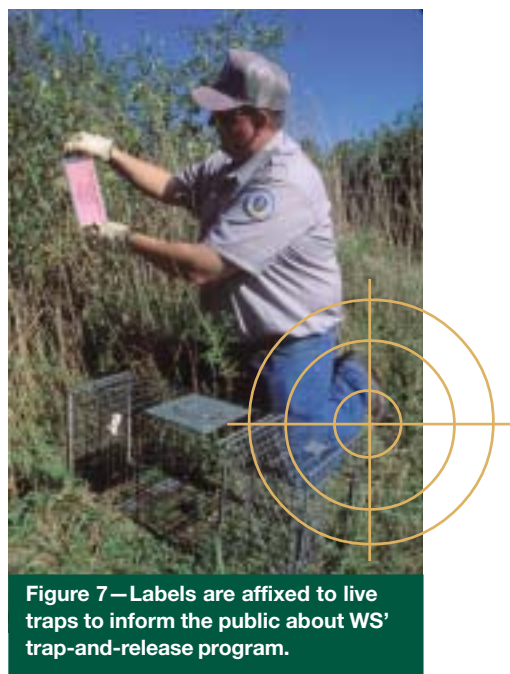
Figure 7—Labels are affixed to live traps to inform the public about WS' trap-and-release program.

The development of effective ORV programs promises to change rabies management in the future. Preliminary successes of ORV campaigns in Europe and Canada, along with recent field trials in the United States, have advanced our understanding of rabies management methods. The cost-effectiveness of the ORV to prevent and contain specific strains of rabies continues to be a central issue that will require careful evaluation.