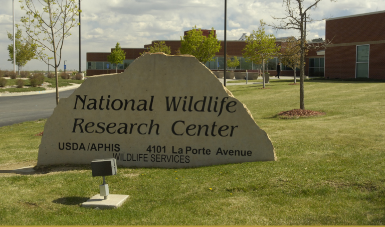
NWRC headquarters in Fort Collins, CO.