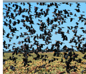
Roughly 27 million red-winged blackbirds, 13 million common grackles, and 12 million yellow-headed blackbirds migrate through the Great Plains each year.

Since 1991, WS Operations personnel have been spraying cattails on private and public lands, averaging