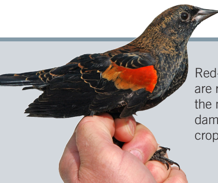
Red-winged blackbirds are responsible for the majority of wildlife damage to sunflower crops.

To help reduce blackbird damage to commercial sunflower crops, scientists at the Bismarck, ND, field station of the U.S. Department of Agriculture's (USDA) Wildlife Services' (WS) National Wildlife Research