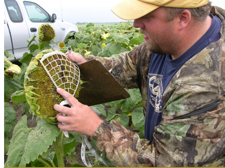
Researchers from NWRC and NDSU are exploring new methods, such as “lure” crops, to reduce blackbird damage to sunflowers.

about 5,000 acres per year. Treatment planners focus on cattail stands of 10 or more acres with a history of blackbird use. The stands are sprayed with glyphosate, a Government-approved aquatic herbicide, between mid-July and early September. The herbicide is applied in strips, which leaves untreated habitat to be used by other migratory birds that prefer more open areas.