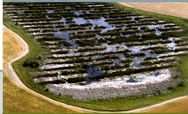
Cattail stands are thinned to make them less suitable for blackbirds.