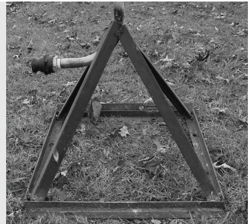
Figure 3 SLS base.

10. A supply of water (at least 500 gal of water per sprinkler head) should then be attached to the pump with a 2-inch-diameter flexible hose. Water trailers containing 1,000 gal or more work well and can be transported to the site. A distance of 400 ft between the pump and sprinkler head is advised.