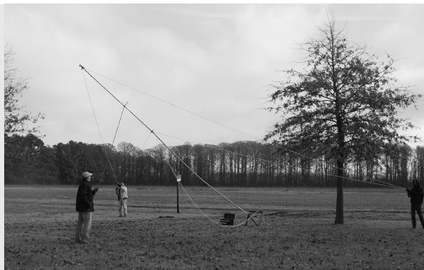
Figure 1 Positioning the SLS sprayer may require three or more people.

Employees of the U.S. Department of Agriculture's (USDA) Wildlife Services (WS) program are often asked by State agencies, municipalities, business owners, and landowners for assistance with dispersing or removing starling and blackbird roosts.