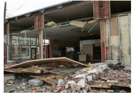
This business in Seattle was heavily damaged during the magnitude 6.8 Nisqually, Wash., earthquake on February 28, 2001. About 400 people were injured during the earthquake.

The USGS will continue to improve on existing earthquake monitoring, assessment, and research activities, with the ultimate goal of providing new products that facilitate more effective mitigation and response.