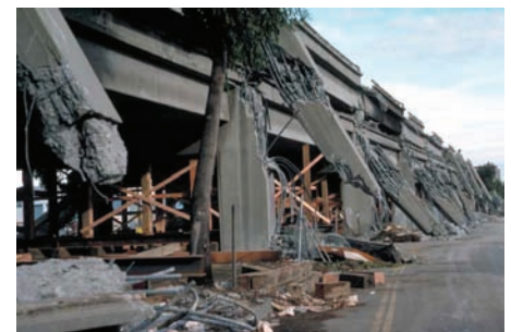
The upper level of this two-level section of Interstate 880 in Oakland, Calif., collapsed during the magnitude 6.9 Loma Prieta, Calif., earthquake on October 17, 1989. Forty-one motorists were killed in the collapse.

The USGS supports regional, national, and global seismic-monitoring networks, studies why earthquakes occur and how they shake the ground, assesses the