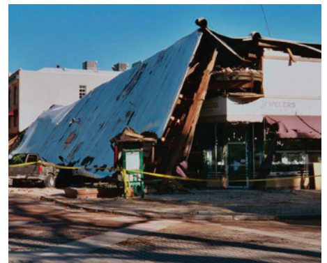
A vehicle, seen near the left edge of this image, was crushed under this collapsed storefront in Paso Robles, Calif., during the magnitude 6.5 San Simeon, Calif., earthquake on December 22, 2003. Two people were killed trying to get out of the store during the earthquake.