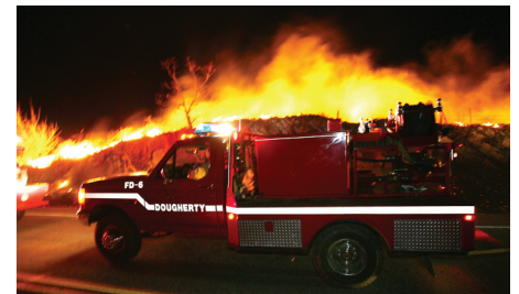
Firefighters work to control a wildfire near Springer, Okla., on Monday, January 16, 2006.

The USGS conducts vegetation and fuels mapping to support firefighting readiness, reduce wildfire hazards in the wildland-urban interface, and assess wildfire effects on ecosystems.