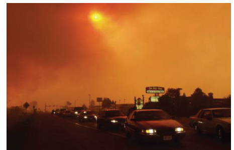
The evening sun barely penetrates smoke and ash as evacuees flee Glenwood Springs, Colo., because of spreading wildfires on Saturday, June 8, 2002.