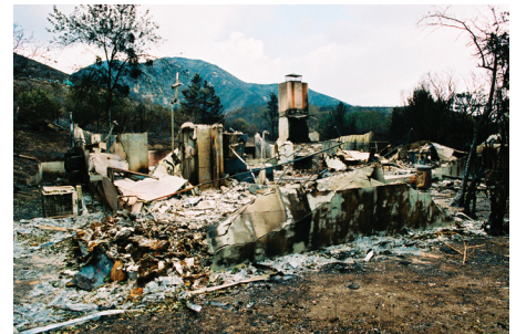
A wildfire left very little of this home near San Bernardino, Calif., in October 2003.