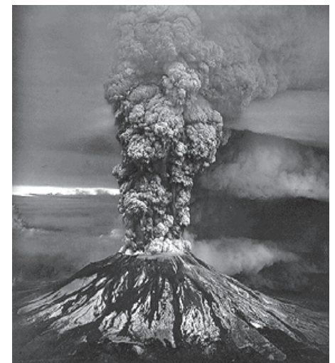
Mount St. Helens in Washington State explosively erupts on Sunday, May 18, 1980. The eruption led to 57 deaths.

Noxious volcanic gas emissions have caused widespread lung problems. Airborne ash clouds have disrupted the health, lives, and businesses of hundreds of thousands of people; caused millions of dollars of aircraft damage; and nearly brought down passenger flights.