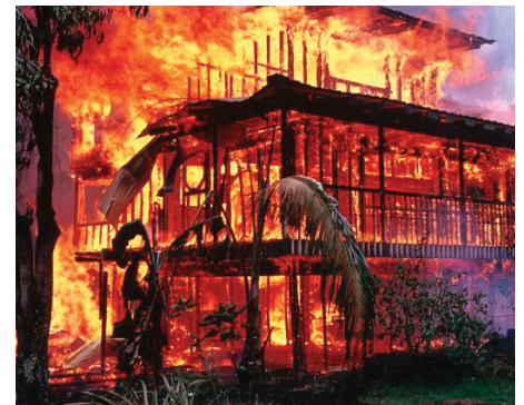
This house in Kalapana, Hawaii, is burned by approaching lava from Kilauea Volcano on Sunday, April 22, 1990. Most of Kalapana was destroyed by lava flows between 1986 and 1990, with 180 homes lost.

The USGS helps the public, policy-makers, and emergency managers make informed decisions on how to prepare for and react to volcano hazards and reduce losses from future volcanic eruptions and debris flows.