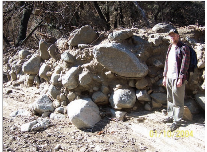
Debris-flow deposits produced during a Christmas day 2003 storm in Waterman Canyon, San Bernardino County, California.