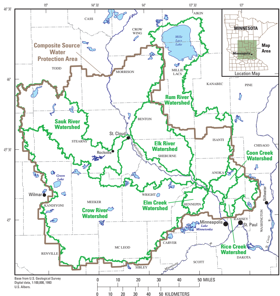
Figure 1. Locations of selected river watersheds tributary to the Upper Mississippi River and Composite Source Water Protection Area.

Protection Plans need to be based on reliable hydrologic information and coordinated effectively through interagency communication. Understanding travel-times in the streams that flow into the Mississippi River is a necessary part of the plans because delineation of Source Water Protection Areas, particularly within the inner area, is based primarily on the transport time of potential contaminants to a water intake. Source Water Protection Plans were based, in