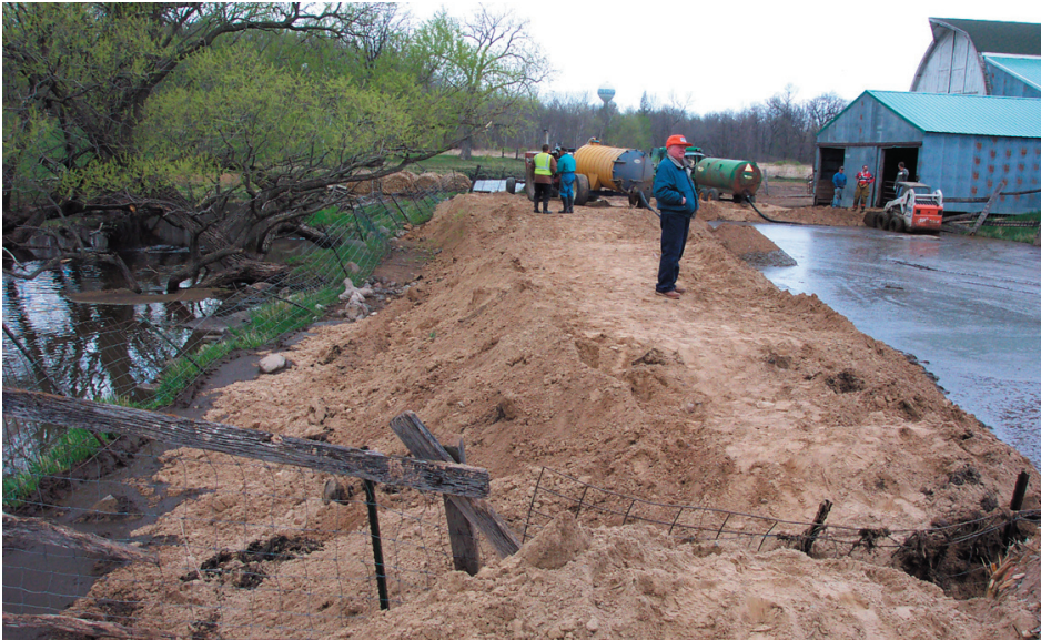
Figure 6. Response activities showing Mill Creek. Photograph by Walter Haas, Minnesota Pollution Control Agency, 2004.

returned to normal and water clarity was good.