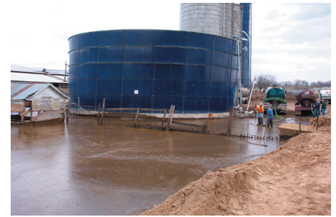
Figure 5. Response activities to manure release. Photograph by Walter Haas, Minnesota Pollution Control Agency, 2004.

As the result of prompt communication and action, staff from the city of St. Cloud and Stearns County responded quickly to the incident. The local fire department coordinated construction of an earthen containment dike, limiting releases to Mill Creek. Manure that entered the creek traveled 16 miles downstream in the Sauk River, to the confluence with the Mississippi River, just upstream from St. Cloud's water intakes. Estimates of the time that would elapse before the contaminants reached St. Cloud (16 hours) were provided by the USGS, based on traveltime estimates (Arntson and others, 2004) and flow conditions existing at the time. Based on this estimate, water intakes were closed as the plume passed. Staff from the Minnesota Department of Natural Resources (MDNR) and the city of St. Cloud measured movement of the contaminants as they passed the intakes. The travel-time estimates were found to be accurate, based on fecal coliform testing at the intake. The duration of the plume was approximately 6 hours at the intakes and they were closed for 8 hours. With the estimated streamflow of the Mississippi River at the time of the spill of 6,300 cubic feet per second ( \text{ft}^3/\text{s} ), compared to the flow of the Sauk River of 213 \text{ ft}^3/\text{s} , based on data from USGS gaging stations, the plume was substantially diluted in the Mississippi River as it traveled downstream in the Mississippi River.