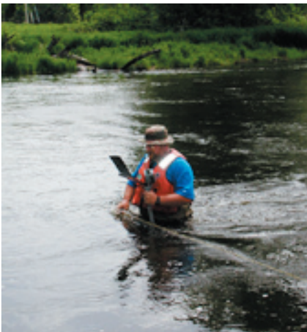
Figure 7. Streamflow measurement, Sauk River.

Stearns County has increased educational efforts for management and maintenance of Liquid Manure Storage Structures (LMSS) as a result of the 2004 cattle manure release. Currently (2005), there are about 705 LMSS in the county. However, only 418 of these are permitted by County or MPCA officials. The County has modified zoning ordinances to ensure that new LMSS meet minimum structural setback requirements to protect streams and lakes from possible future releases of liquid cattle manure (Robert