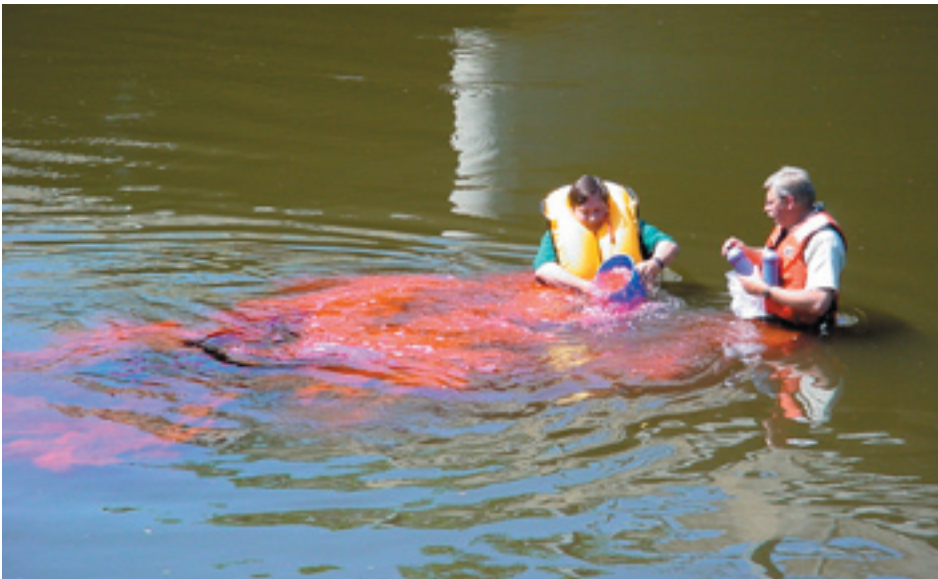
Figure 3. Dye release to Sauk River.

on the Mississippi River, a distance of approximately 16 miles. Dye concentrations were measured and tracer-response curves were developed to determine times of peak concentrations and traveltimes (table 1 and fig. 4). Water samples at the St. Cloud water intakes on the Mississippi River showed that approximately 30 percent of the water entering St. Cloud's intake at the time of the study was contributed by the Sauk River, even though the Sauk River contributed only 10 percent of the flow in the Mississippi River by volume. The disproportionate flow at the intake was due to the way the Sauk River flow stays near the west bank of the Mississippi River as it flows past the water intakes.