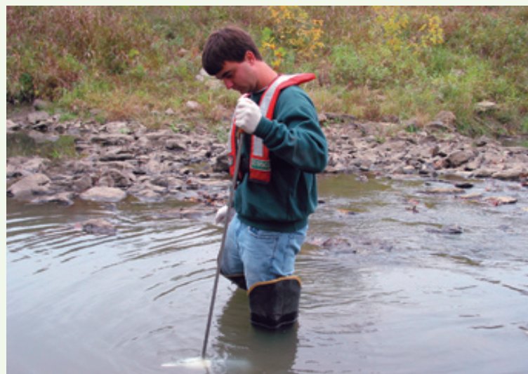
USGS scientist measuring water-quality conditions at Mill Creek at Johnson Drive (site MI7).

The information from this study can be used by Johnson County officials to evaluate the condition of Johnson County streams, identify potential source areas of contamination, and develop practices to reduce contaminant effects on Johnson County streams.