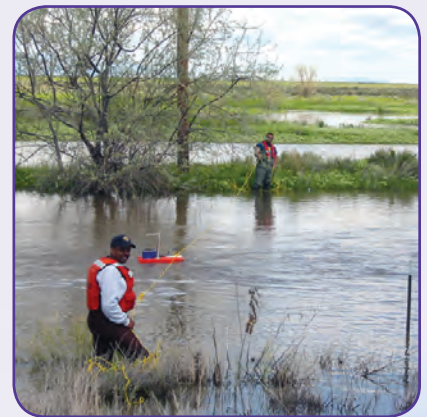
USGS hydrologic technicians measuring surface-water discharge.