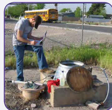
USGS hydrologic technician collecting ground-water data from a well.

Continuous well measurements are made at more than 15 wells throughout the State. Periodic well measurements are made at more than 800 wells but the number of wells can vary from year to year. Periodic measurements are made at approximately the same times each year to reduce seasonal effects. Water-quality data are collected at more than 130 wells and can vary depending on project needs. New wells are added to the network as old wells are destroyed, local land use changes, and other needs arise.