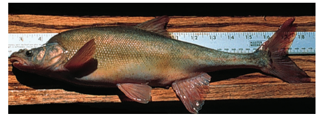
Adult humpback chub

The Asian fish tapeworm may inhibit the recovery of the humpback chub in the Grand Canyon.