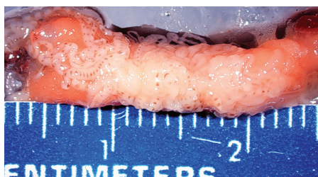
Intestine of bonytail chub infected with tapeworms

Seasonal field parasite surveys of fish in the LCR during 1999 and 2000 revealed that of the 1,435 native and non-native fish examined, all species could be infected