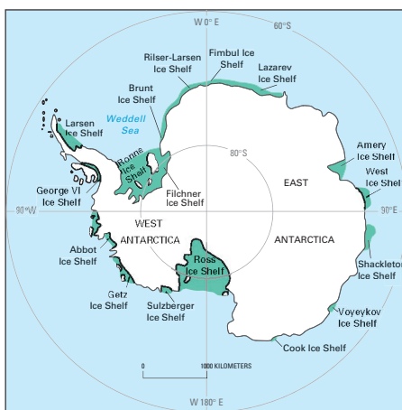
Figure 1. Index map to the principal geographic features of Antarctica, including the ice shelves where large coastal-change events commonly occur.

Ice fronts, iceberg tongues, and glacier tongues are the most dynamic and changeable features in the coastal regions of Antarctica. Floating ice margins are subject to frequent and large calving events or rapid flow. These situations lead to annual and decadal changes in the position of ice fronts on the order of