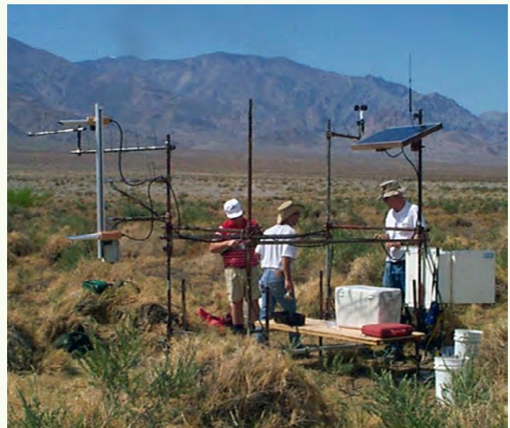
USGS scientists assemble an evapotranspiration station.

To accomplish the objectives of this study, participants from the USGS Water Science Centers in Nevada and Utah, and the Geology Science Centers in Denver and Menlo Park; DRI in Reno and Las Vegas; and the Utah State Engineer's Office, will work cooperatively on separate but coordinated tasks.