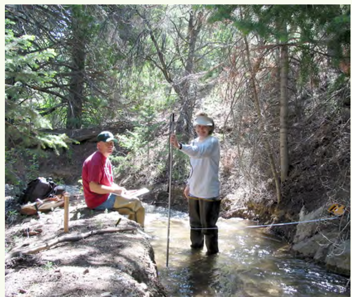
USGS scientists measuring streamflow.