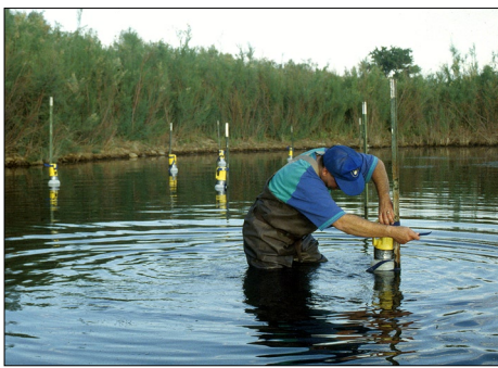
Fisheries biologists conduct in situ toxicity tests to assess the biological significance of degraded water quality.