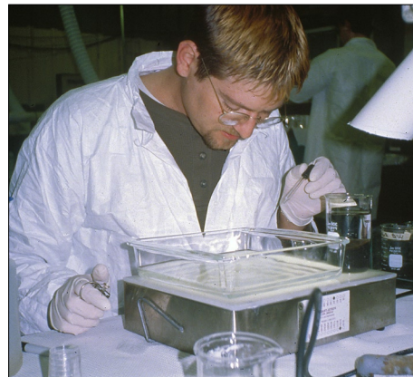
Sediment toxicity test development requires establishing standard procedures such as seen above, placing test organisms into test beakers.