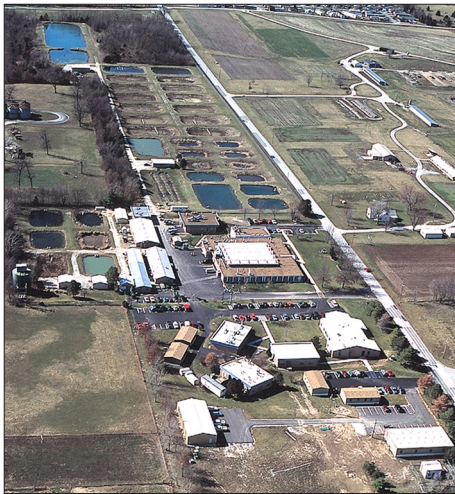
The USGS Columbia Environmental Research Center is located in Columbia, Missouri, with research and monitoring programs extending across our nation and other countries.