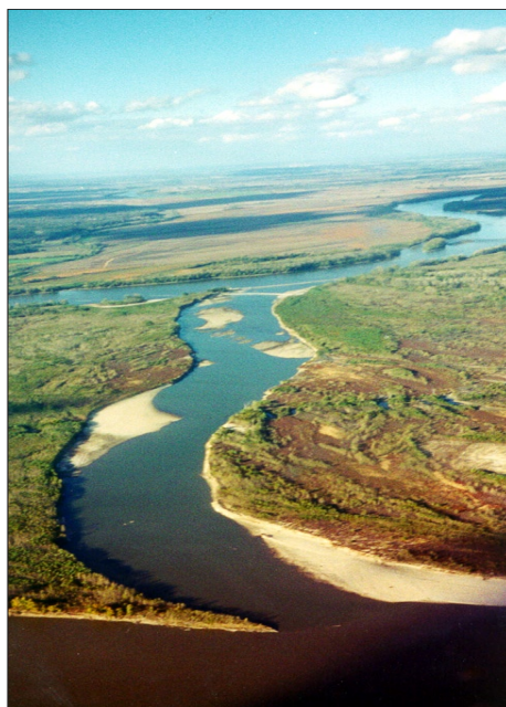
The pre-development Missouri River represented one of North America's most diverse ecosystems with abundant braided channels, riparian lands, chutes, sloughs, islands, sandbars, and backwater areas.

Current efforts are underway to move CERC to a new level of recognition in providing information to aid in floodplain management for the lower Missouri River. These new activities provide scientific information to decision makers and are the basis for the Missouri River InfoLINK. The InfoLINK is an Internet-based Missouri River information clearinghouse, created for stakeholders who want to understand how the river functions and make informed decisions about the river's future use and management. The InfoLINK web page includes maps that provide a visual perspective of Missouri River basin information.