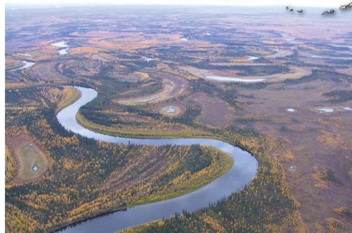
The 13,500-square-mile (35,000 km 2 ) Yukon Flats assessment area is characterized by low, forested hills, flatlands, meadows, meandering streams, and lakes. This photograph, taken northwest of Circle, Alaska, shows a typical landscape of the region.

(source-rock maturation, hydrocarbon generation, and hydrocarbon migration), reservoir rocks (sequence stratigraphy and