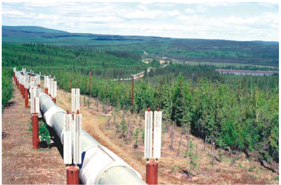
Photograph looking northward across the Trans-Alaska Pipeline System, showing low, forested hills along the Yukon River (right-hand edge of photo), near the west edge of the Yukon Flats assessment area.

The USGS assessment strategy provides estimates of the volumes of undiscovered petroleum (mainly oil, gas, and natural-gas liquids) that are technically recoverable and that have the potential to be added to reserves in a 30-year forecast span. For the Yukon Flats Tertiary Composite Total Petroleum System, the USGS estimates a mean of 5.46 trillion cubic feet of gas (TCFG), a mean of 172.66 million barrels of oil (MMBO), and a mean of 126.67 million barrels of natural-gas liquids (MMBNGL). Nearly all