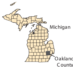
Figure 2: Predicted probability of encountering a clay layer ten or more feet thick in the glacial aquifer, Oakland County, Michigan.