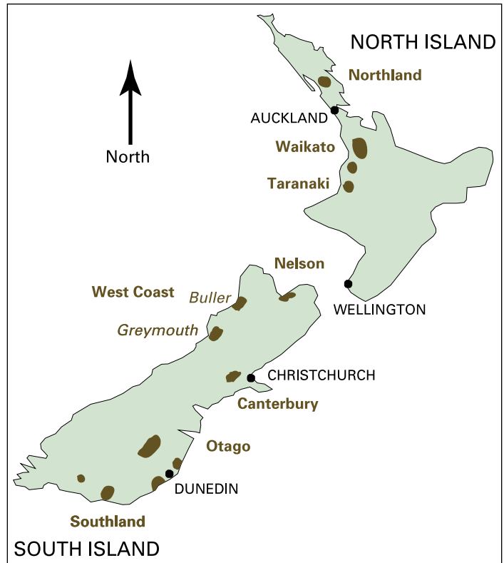
Figure 1. Major coal regions (bold brown type) and coal fields (italic brown type) of New Zealand.

Before 1940, less than 10 percent of production was from opencast mines. Opencast production has increased steadily to 80 percent of current production. Of the 3.5 Mt of coal produced in 1996, 47 percent was bituminous, 46 percent subbituminous, and 7 percent lignite. All bituminous production was from the West Coast region, and most subbituminous production was from the Waikato region, with much smaller amounts from the Southland and West Coast regions. Lignite production was from the Southland and Otago regions, with very small amounts from the Canterbury and West Coast regions (New Zealand Ministry of Commerce, 1998b).