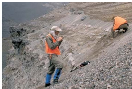
Geologists examine rock layers in Aniakchak Caldera to decipher the volcano's eruptive history and determine its future potential hazards. The caldera, a large volcanic depression, formed during a catastrophic explosive eruption 3,500 years ago. These deposits within the caldera were formed by subsequent smaller eruptions.

A network of six to eight seismometers around a volcano is required to detect and accurately locate earthquake activity typically associated with magma rising into a volcano.