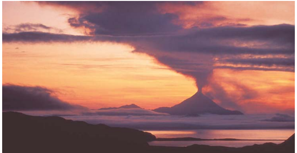
This photo shows Kanaga Volcano, located 1,215 miles southwest of Anchorage in the western Aleutian Islands, during its 1993-95 eruption. At that time, the nearest volcano monitored with a real-time seismic network adequate to detect the small earthquakes that typically precede an eruption was Katmai, about 900 miles away. Since 1996, in order to detect volcanic unrest and eruptions along the Aleutian volcanic chain, scientists of the Alaska Volcano Observatory have significantly increased the number of volcanoes they monitor and study. A primary goal of the expansion is to provide accurate information about eruptions that could generate clouds of volcanic ash, a major threat to flying jet aircraft. By early 2004, Kanaga was among 27 volcanoes in Alaska monitored with ground-based seismic networks. All Alaskan volcanoes are monitored by satellite, using remote-sensing methods.

The explosive onset of the eruption of Redoubt Volcano on December 14, 1989, was