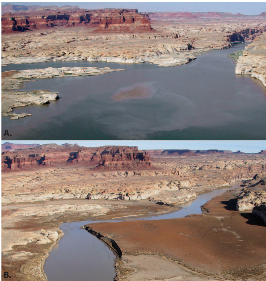
Figure 2. Replicate photographs of Lake Powell at the confluence with the Dirty Devil River (entering from left). A. June 29, 2002. B. December 23, 2003.

instead to dissipate over the ocean. Residual moisture from such storms, however, which can be considerable, is occasionally transported inland into the southwestern United States. This residual moisture, as well as that from tropical systems that occasionally transit the Southwest, produces precipitation that can generate large floods in the southern half of the Colorado River basin.