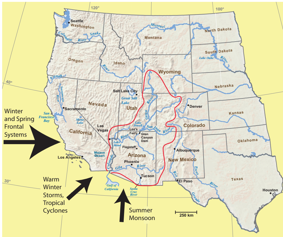
Figure 1. Moisture sources to the Colorado River basin.

Precipitation on the Colorado Plateau is biseasonal, having both winter and summer regimes (Hereford and others, 2002). In the headwaters, precipitation generally is evenly distributed across the four seasons, accumulating mostly in snowpacks. Moisture comes from several sources (fig. 1). Winter and spring frontal systems originating in the North Pacific Ocean, provide the largest and most important source of moisture. These large-scale systems tend to carry moisture at higher levels in the atmosphere, with orographic effects of the mountainous West causing an increase in