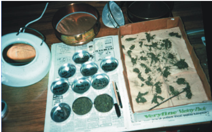
Figure 2. Seeds dispersed in baldcypress swamps. The green material on the surface of the water is a microcosm of the swamp. More than 40 species of seeds float in the water, along with whole plants of duckweeds, liverworts, mosses, as well as insects and insect larvae. Everything that is required to make a new swamp floats in the water and simply needs to be carried by water flow to an environment in which a swamp can sustain itself. Consequently, swamps can restore themselves if we provide them with the appropriate landscape connections.

The green material that floats on the surface of the water in swamps resembles duckweed ( Lemna spp., Spirodela spp.), but it contains everything that is biologically required to make a new swamp (fig. 2). In addition to duckweed, seeds of the dominant species as well as many others float on the surface