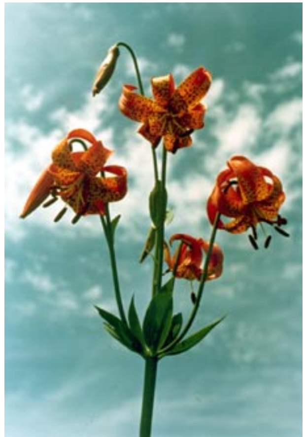
Figure 4. Winter burning stimulated the flowering and occurrence of desirable forbs in the ungrazed sedge meadow, including Lilium michiganense . The same burn treatment did not increase forbs in the formerly grazed sedge meadow, nor did it decrease the amount of dogwood (Middleton, 2002b). Further studies are exploring ways to restore the diversity of formerly grazed sedge meadows.

Unlike the grazed site, the effects of winter burning in the ungrazed site were beneficial. Desirable forbs that had been absent from the vegetation for at least a decade flowered and set seed the following year. This flush of forbs lasted only for a year or two; however, the long-term result of winter fire may be that these species are retained as seeds in the seed bank, and this is valuable in preserving long-term biodiversity of these species. The forb species that disappeared from vegetation and then flourished after winter fire included marsh bellflower ( Campanula aparinoides ), turtlehead ( Chelone glabra ), marsh pea ( Lathyrus palustris ), gentian ( Gentiana puberulenta ), iris ( Iris virginica ) and Michigan lily ( Lilium michiganense ; fig. 4).