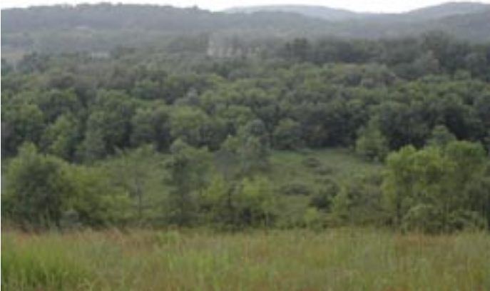
Figure 3b. Sedge meadow in 2001, 24 years after cattle grazing stopped and shrubs invaded (Lodi Marsh State Natural Area: photo by Beth Middleton).