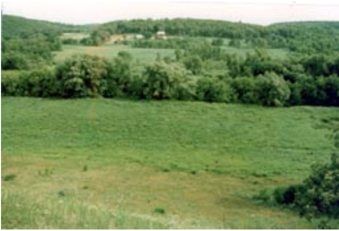
Figure 3a. Sedge meadow in 1978 shortly after cattle grazing stopped. Note the lack of shrubs.