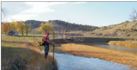
Tongue River at State Line, Montana (site 2, fig. 1).

Develop real-time SAR estimates and measurement techniques. Providing real-time SAR information will be addressed in two ways. First, statistical relations between specific conductance and SAR will be examined for each station (fig. 2). If these relations are statistically meaningful, real-time estimates of SAR will be generated from continuous specific-conductance data for each station. Second, recent technological advances have made possible the development of experimental instrumentation that can be placed in the field and provide automated measurements of the constituents (calcium, magnesium, and sodium) which are used to calculate SAR. One analyzer will be built, deployed, and tested during 2004. If that is successful, a second instrument will be deployed in 2005.