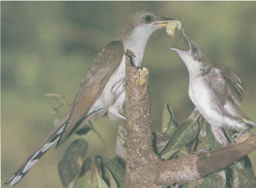
The yellow-billed cuckoo was one of the most common species in our study area.

Our study showed that the three habitat types (young forests, open shrub habitats, and mature forests) together supported a diversity of bird species (69 species). The species we most frequently observed were the indigo bunting ( Passerina cyanea ), red-winged blackbird ( Agelaius phoeniceus ), and yellow-billed cuckoo ( Coccyzus americanus ). Mature silver maple-dominated forests supported the largest number of bird species (46) compared with the young forests and shrub habitats, which hosted 34 and 38 species, respectively. The open habitat and mature forest each had distinct bird communities not shared with the other habitats, but the young forests shared a number of species with the other two habitat types. No species emerged as an indicator of young cottonwood-willow forests, but the shrub/scrub and mature forest habitats were each associated with a set of indicator bird species. We detected several bird species of management concern, including the orchard oriole ( Icterus spurius ) and the field sparrow ( Spizella pusilla ) in the young forests; the dickcissel ( Spiza americana ) in the open habitat; and the red-headed woodpecker ( Melanerpes erythrocephalus ), northern flicker ( Colaptes auratus ), Kentucky warbler ( Oporornis formosus ), Acadian flycatcher