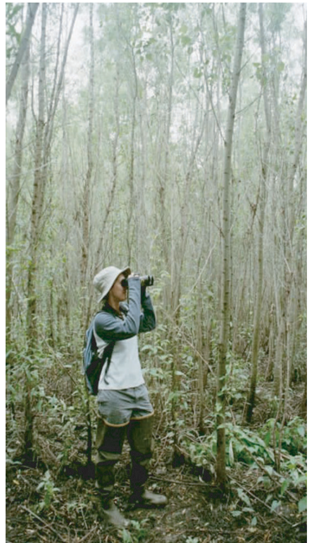
Young forests comprise primarily willow ( Salix spp. ) and cottonwood ( Populus deltoides ) trees established on abandoned agricultural land after the 1993 flood on the Mississippi River.