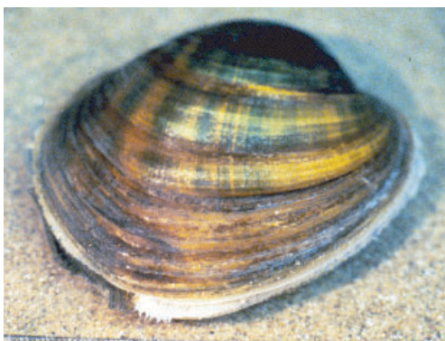
The Higgins eye ( Lampsilis higginsii ) is one of several freshwater mussel species in the Upper Mississippi River Basin on the Federal endangered species list.

Although many threats may be contributing to the declines in species density and diversity, past efforts have not determined which threats are most important. Because freshwater mussels are declining nationwide, it is important to understand what contributes to their distribution (location) and abundance (numbers) across large geographic areas. Much of the research on mussels has been conducted on small streams by teams of mussel specialists measuring traditional habitat variables. Most attempts to predict the distribution or abundance of mussels from variables such as substrate type or water depth have failed when tested critically, suggesting that these measures are inadequate descriptors of mussel communities. Also, many freshwater mussels require a fish host to complete their life cycle. Therefore, management approaches need to maintain the connection between mussels and their host fish. Further advances in understanding mussel populations will probably require a multidisciplinary approach that includes biology, chemistry, and hydrology in both large and small geographic areas.