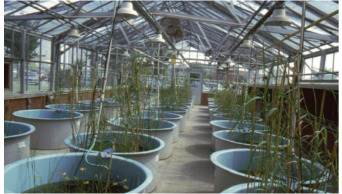
Fig. 1. In greenhouse studies, clones of the four plant species were arranged in tanks within which salinity, water depth, and nutrients were controlled.

The greenhouse studies allowed strict control of environmental conditions and provided baseline information about what conditions affect plant growth and survival; this information helps determine which plant species and clones are best suited for restoration activities. For the first greenhouse experiment, plants were potted in commercial soil. The species were divided into two habitat groups, brackish marsh (common reed and giant bulrush) and salt marsh (saltgrass and saltmarsh bulrush), and placed into large fiberglass tanks for treatment application (fig. 1).