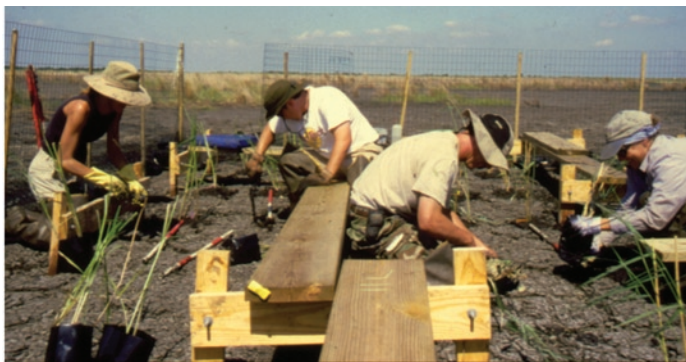
Fig. 3. The experimental plants were transplanted from the greenhouse into a brackish marsh that was restored by using dredged sediments from the adjacent bayou.

site to monitor natural succession. Plots were also placed on nearby naturally vegetated nondredge (reference) sites. Plant growth (percent cover, stem numbers), sedimentation, and water quality were monitored over two growing seasons.