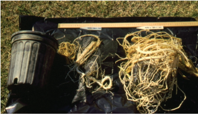
Fig. 2. Significant clonal variation was found in the belowground (roots and rhizomes) biomass of common reed ( Phragmites australis ). Clone 1 (left) accumulated lower biomass than clone 6 (right) at both shallow and deep water depths, regardless of salinity.