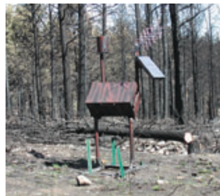
C. Precipitation gage used in burned area at Battle Creek Fire.