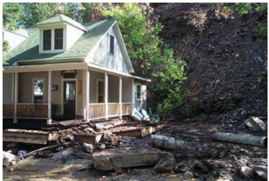
Figure 2. Mudslides occurred on August 8, 2002, in Deadwood, South Dakota, after precipitation fell in the burned area of the Grizzly Gulch Fire.

USDA and USDI land-management agencies with BAER authority have little or no expertise in flood forecasting and no authority to issue or carry out flood warnings or evacuations. The USGS has a similar