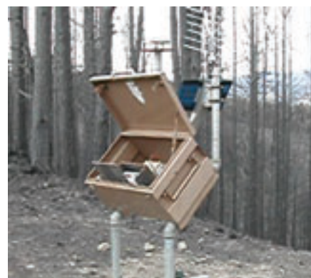
B. Precipitation gage used in burned area at Grizzly Gulch Fire.