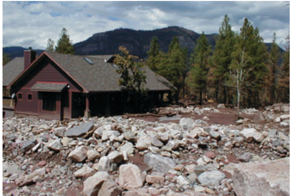
Figure 1. Mudslides occurred on August 4, 2002, after precipitation fell in the burned area of the Missionary Ridge Fire.

The fire originated near the town of Durango and intensely burned the steep watersheds above the east side of town. From there, the fire moved in a northeasterly direction and burned areas around Vallecito and Lemon Reservoirs. Both of the reservoirs are municipal water supplies. Many homes and roads are located below burned watersheds and in the direct path of predicted flood and debris-flow areas (fig. 1). The BAER team calculated that relatively small amounts of rainfall could cause flood