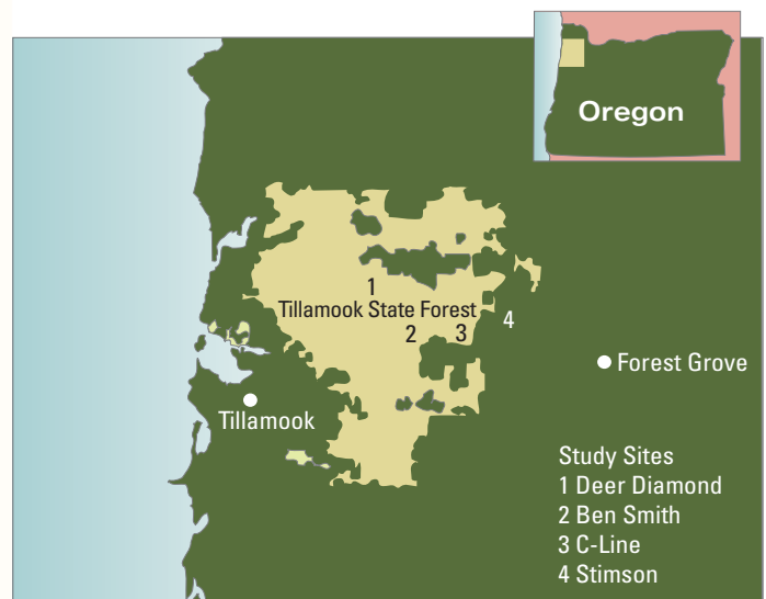
Figure 1. Map of Tillamook study sites.