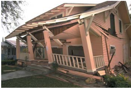
The 1994 Northridge, California, earthquake resulted in 72 deaths and $25 billion in damages. The National Map is a geographic framework for specialized earthquake and other natural hazards data.

For wildland fires, the integrated elevation, transportation, land cover, and water feature data from The National Map are used by emergency operations specialists to plan the distribution of fire-fighting equipment and personnel and are combined with other data, such as wind direction, speed, and relative humidity, to model and predict the behavior of a fire.