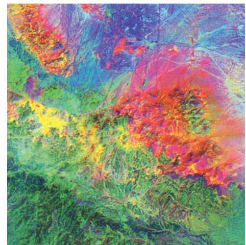
ASTER vnir-swir decorrelation stretch 4(R), 3 (G), 7(B) Saturation stretch.