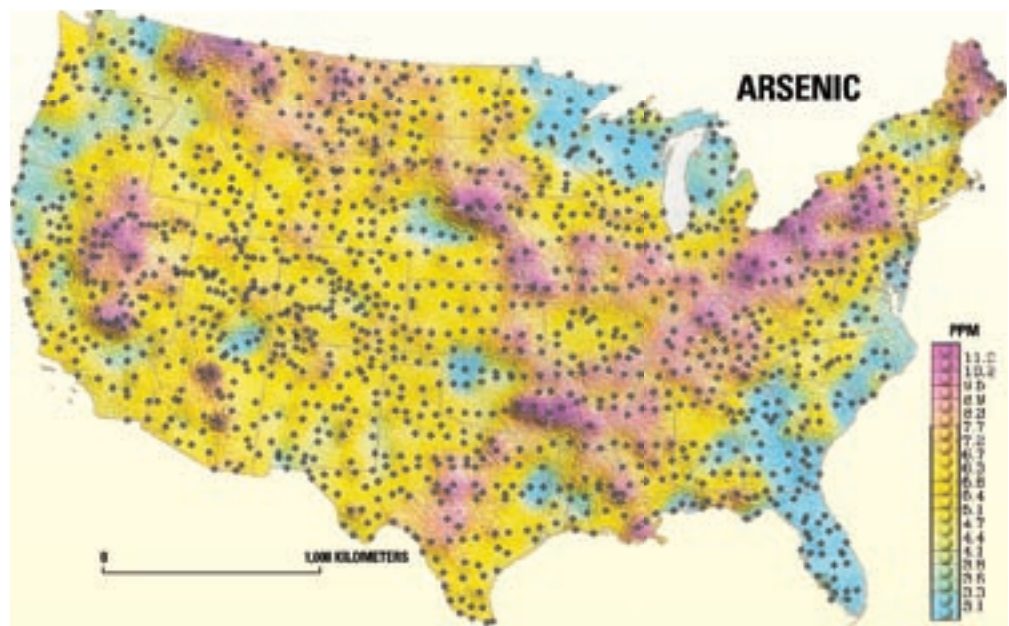
Figure 1. Map of arsenic distribution in soils and other surficial materials of the conterminous United States based on 1,323 sample localities as represented by the black dots.

The only other national-scale soil geochemical data set for the United States was generated by the Natural Resources Conservation Service (NRCS), formerly the Soil Conservation Service (Holmgren and others, 1993). This data set consists of 3,045 samples of agricultural soil collected from major crop-producing areas of the conterminous United