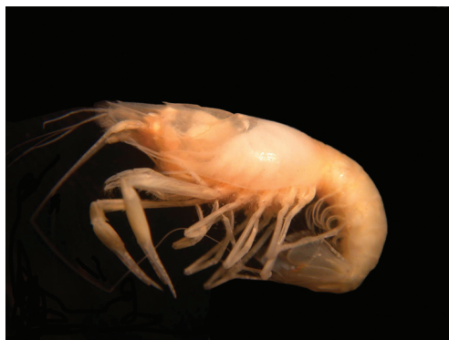
Figure 3. Photograph of the pallid cave crayfish ( Procambarus pallidus ), a blind cave-dwelling crustacean found in ground water of the Floridan aquifer in the Suwannee River Basin.

Information is limited concerning the occurrence of "exotic" contaminants, such as pharmaceuticals, bacteria, pesticides, herbicides, and their transformation products (degradates) in water from the Upper Floridan aquifer. However, herbicides have been detected in trace concentrations in 9 of 15 springs discharging from the Upper Floridan aquifer in southern Georgia (Hippe, 1997). Pesticide and herbicide use is potentially high in the Suwannee River basin due to large crop acreages of corn, peanuts, tobacco, and watermelons in the middle and lower Suwannee River basin. Low concentrations of these compounds, and their transformation products, may result in observable effects on aquatic organisms and pose an environmental risk (Kolpin and others, 2002). Water samples from Manatee Springs are being collected and analyzed for selected pesticides, herbicides and their metabolites, and antibiotics to assess the occurrence of contaminants (other than nutrients) associated with various agricultural activities in the basin.