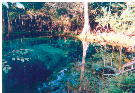
Figure 1. Photograph of main spring pool at Manatee Springs.

than 1.5 mg/L during the past few years. Elevated nitrate concentrations combined with high spring flows have contributed substantial loads of nitrogen to the Suwannee River from Manatee Springs as well as from several other first-magnitude springs along the river. Elevated nitrate concentrations in rivers can accelerate eutrophication, resulting in expansive algal blooms that deplete oxygen and may lead to fish kills or other deleterious impacts. Such adverse ecological effects have been indicated by an increase in periphyton biomass along the lower reaches of the Suwannee River (Hornsby and Mattson, 1998). Also of concern are the effects of high nitrate concentrations in the Suwannee River on the estuary of this river system, which together with the Suwannee River has been designated an Outstanding Florida Waterbody, a State Aquatic Preserve, and a National Wildlife Refuge.