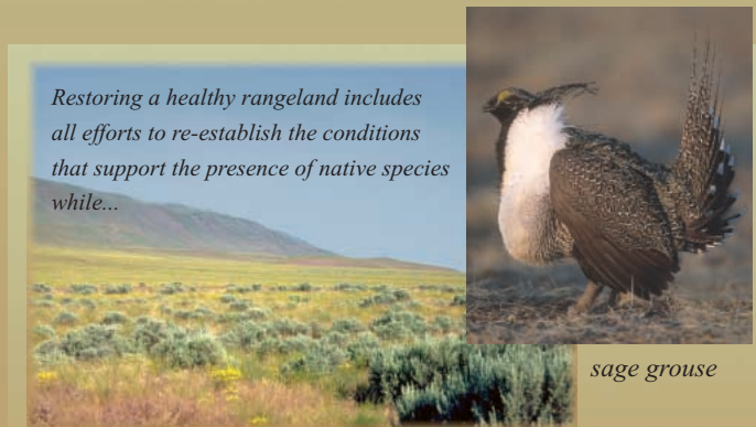
Restoring a healthy rangeland includes all efforts to re-establish the conditions that support the presence of native species while...

change in the natural fire regime. Sagebrush steppe ecosystems of the Great Basin in the western United States are examples of fire-prone ecosystems. Many wildlife species depend on sagebrush steppe ecosystems for survival. Unfortunately, a change in the natural fire regime is decreasing the extent of sagebrush ecosystems, and the populations of wildlife species that depend on sagebrush are undergoing steep declines because of habitat loss. The invasion of cheatgrass is fueling larger and more frequent fires that are out-competing sagebrush as well as the associated forb and grass species that are native components of that ecosystem.