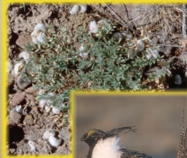
Astragalus purshii (woolypod milkvetch)