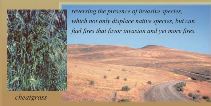
reversing the presence of invasive species, which not only displace native species, but can fuel fires that favor invasion and yet more fires.

Scientists at the USGS Forest and Rangeland Ecosystem Science Center are trying to answer questions about the historic fire-return intervals in these ecosystems and which plants to restore after fires. Most of the work is being conducted on lands managed by the Bureau of Land Management (BLM). A study examining fire records between 1988 and 1999 indicated that there was a doubling of fires in the last 12 years, mostly between 1996 and 1999. All BLM field offices have noted an increase in the proportion of land that has burned over this time period.