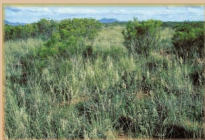
Desert grassland site where grasses promote infiltration and minimize runoff.