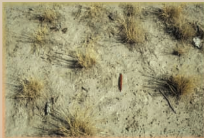
Amount of bare ground is excessive relative to site potential and recent weather.