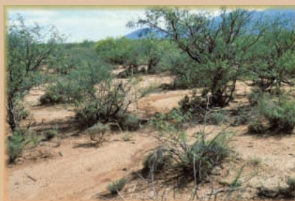
Degraded desert grassland site where runoff has dramatically increased due to conversion from grass to shrubs.