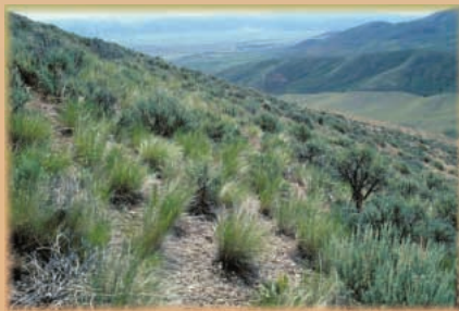
Sagebrush-perennial bunchgrass site near potential. Native annual grasses are a minor component of the vegetative mix.