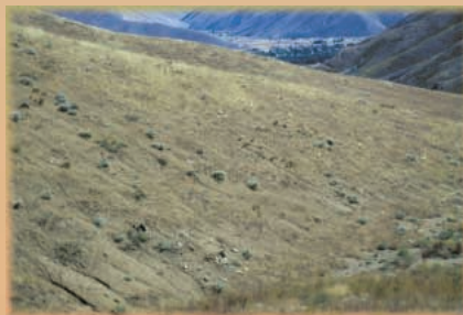
Perennial bunchgrasses have been replaced with cheatgrass, an exotic annual grass. Accelerated erosion is also evident.