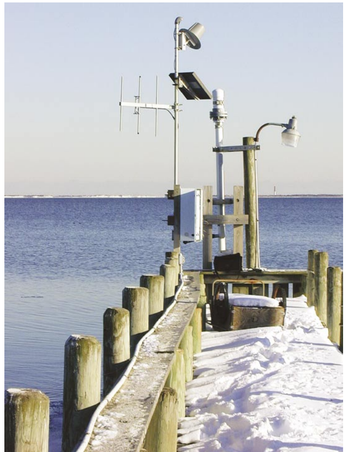
Figure 3. Continuous-record tide gage on the Barnegat Bay at Waretown, New Jersey.

Tide data are collected at two types of stations—(1) continuous-record tide gages (fig. 3) and (2) tidal crest-stage gages. Tide elevations at most continuous-record tide gages are transmitted to base stations by telephone, radio, or satellite links (Summer, 1998). Tidal crest-stage gages are read manually and record the peak tide elevation since the last manual reading. The USGS has recorded limited tide-elevation data since 1921. Peak tide elevations currently are recorded at 30 continuous-record tide gages and 32 tidal crest-stage gages (Reed and others, 2001).