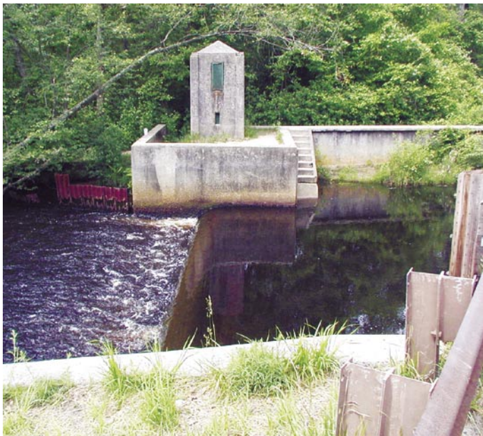
Figure 2. Streamflow-gaging station on the Batsto River at Batsto, New Jersey.

Streamflow-gaging stations (fig. 2) provide a continuous record of streamflow at a predetermined time interval on a continual basis (Reed and others, 2001). The recording interval typically is 15 minutes but may be shorter or longer. The continuous-record streamflow-gaging-station network in New Jersey dates back to 1897 (Gillespie and Schopp, 1982). Daily mean flows currently are recorded at 92 streamflow gages and previously were recorded at an additional 104 gages (Reed and others, 2001). Streamflow statistics such as flow duration, high-flow frequency, and low-flow frequency are used to describe the volume of water flowing past a site and the frequency of occurrence of flows of a given magnitude. Flow durations are computed by first arranging daily mean streamflows in order of magnitude; from these streamflows, a cumulative frequency curve, which shows the percentage of