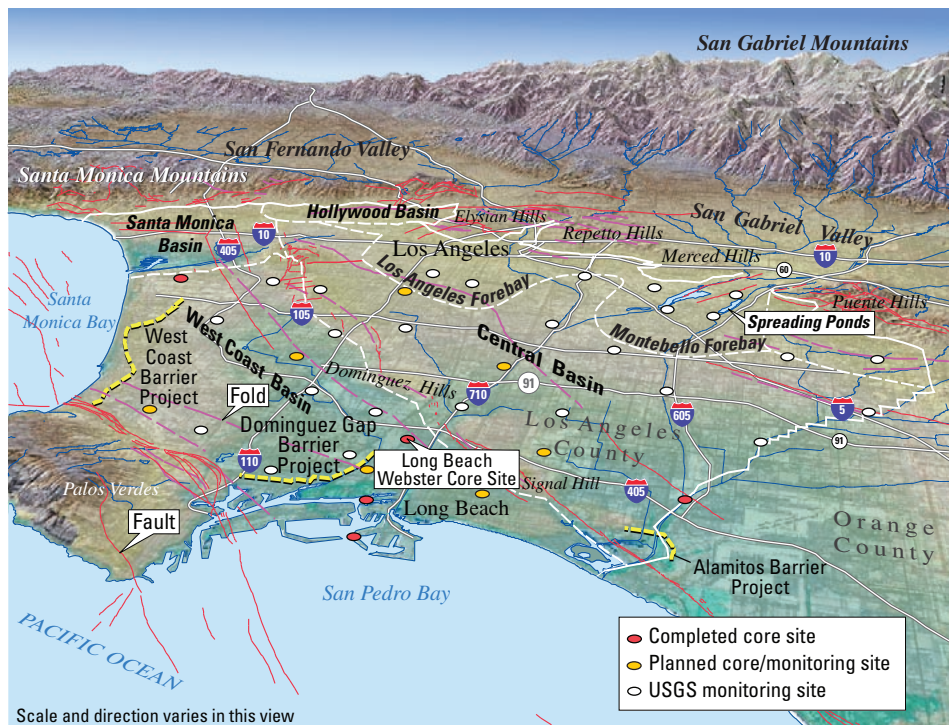
Greater Los Angeles depends on ground water for much of its water supply. As part of a cooperative project with local water-management agencies to better understand the ground-water system and geology of the Los Angeles Basin, the U.S. Geological Survey has drilled more than 30 monitoring wells. Critical issues being examined include the transport and fate of recharge water infiltrated into the ground-water system from spreading ponds in the Montebello Forebay (an area where surface water easily infiltrates the ground) and saltwater intrusion into freshwater aquifers along the coast. In an effort to halt saltwater intrusion, barriers (yellow lines) consisting of arrays of freshwater injection wells have been installed by local water-management agencies.

The USGS has already drilled more than 30 monitoring wells throughout the Los