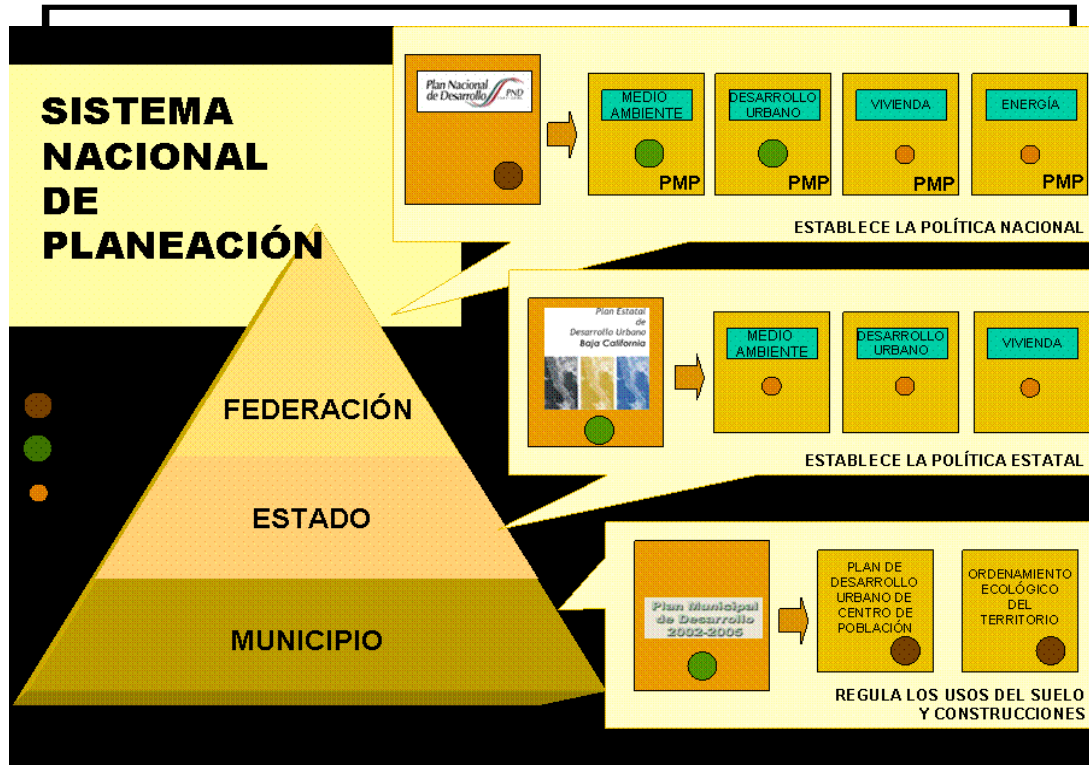
Diagram 1. The National Planning System