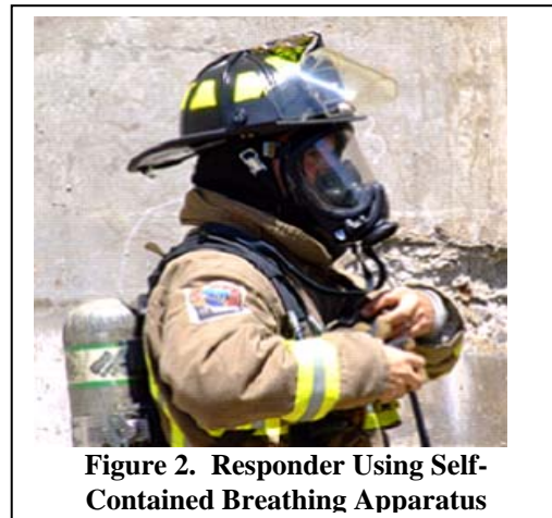
Figure 2. Responder Using Self-Contained Breathing Apparatus

Respiratory Protection. During the January 9, 2006, interior tunnel fire and the July 27, 2005, low-oxygen alarm, the Glenn first responders failed to use appropriate respiratory protective equipment when responding to a potentially hazardous environment. ICS requires all emergency responders to use appropriate personal protective equipment for the tasks they are to perform.