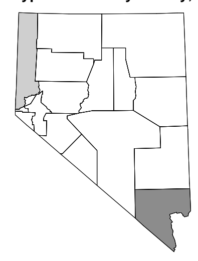
Rate (per 100,000 population)