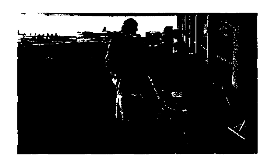
Figure 3. The scabbler in use with the control in place. Note the spray bar, and the valve on the handle