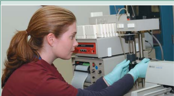
A technician at the Foreign Animal Disease Diagnostic Laboratory performs particle testing of a foot-and-mouth disease vaccine antigen concentrate.

Most of NVSL's full-time career positions are for veterinary medical officers, microbiologists, chemists, biological science laboratory technicians, and animal caretakers. Various other administrative, professional, and technical positions and many student opportunities and summer internships are also available.