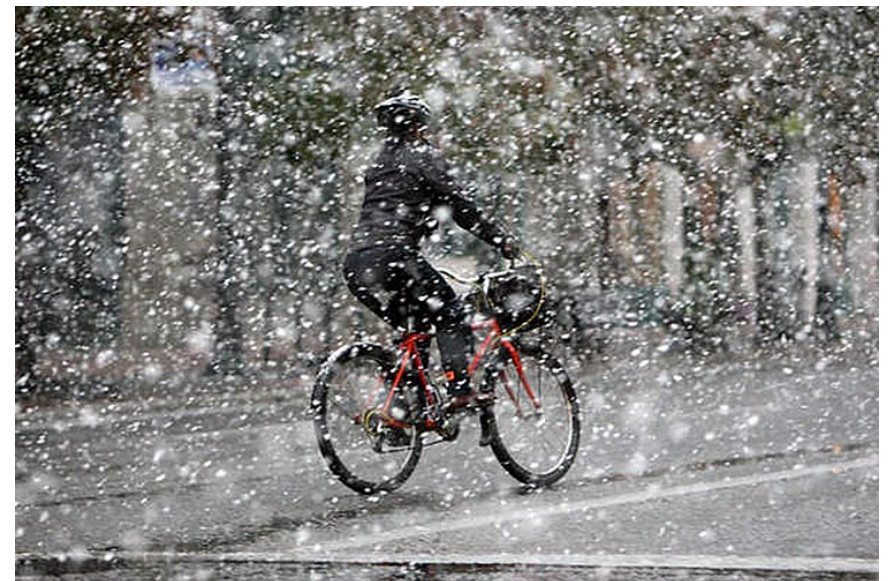
Figure 3-1. The October 12, 2008, snowfall in Boise, Idaho

On December 28, 2007, at the National Renewable Energy Laboratory, a subcontractor slipped on ice in the Visitor Center parking lot while walking to his car, fell, and fractured his wrist. Snow had fallen the previous day, and the lot had been