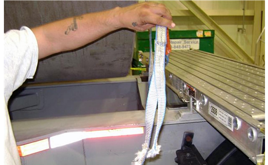
Figure 1-1. Worker holding failed synthetic sling

With the impact limiter installed, the workers positioned themselves to lower the hoist so the rigging equipment could be removed. When the spotter signaled the crane operator to lower the hoist, the operator inadvertently moved the control stick to the hoist (raise) position, instead of the position to lower