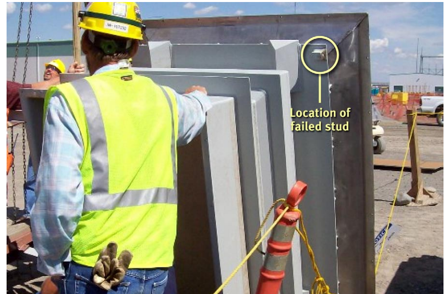
Figure 1-5. Window liner on its side after eye nut stud failure

The shield window liner had to be placed on its side to shorten the legs and jacking bolts had to be added to help with its final positioning in a wall. The drop-forged, heavy-duty eye nuts