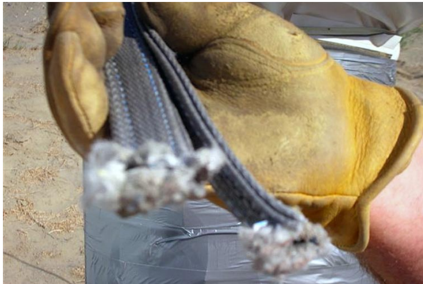
Figure 1-4. The cut sling

Investigators determined that the riggers looked at the safe working capacity of the slings in the basket configuration (6,400 pounds), not the choked configuration (2,400 pounds). However, they rigged them in the choked configuration, with