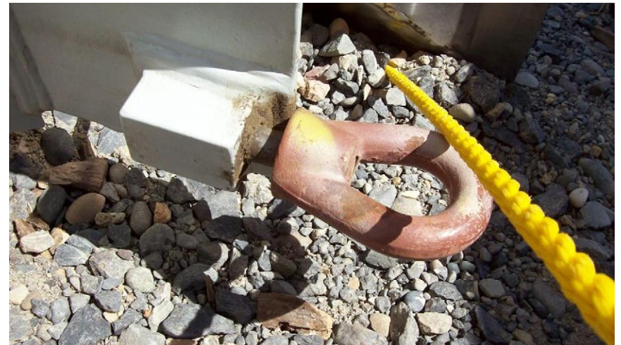
Figure 1-7. One of the four lifting flanges on the liner with a broken stud