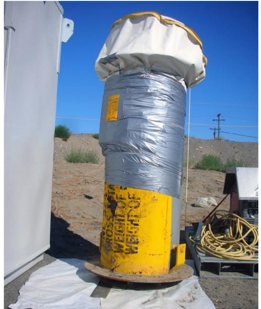
Figure 1-3. The dropped waste cask