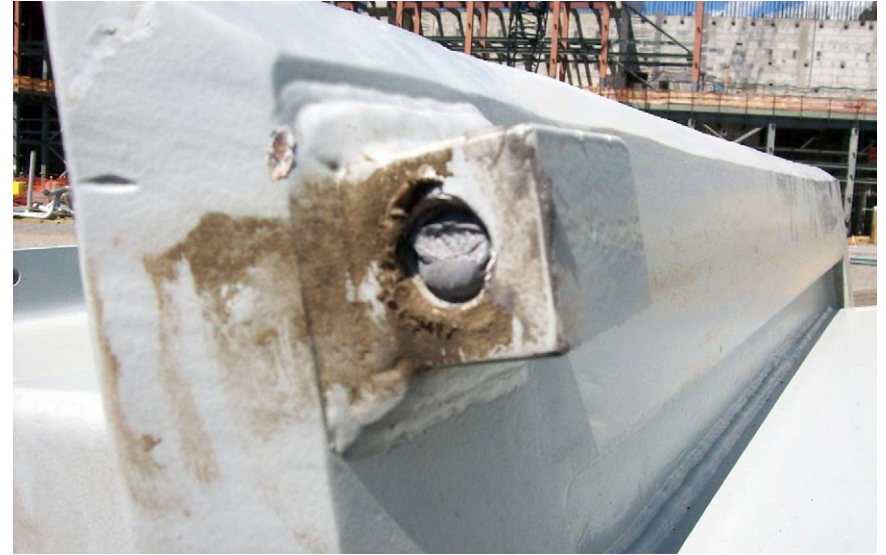
Figure 1-6. Installed eye nut not shouldered to the flange

Investigators learned that the rigger used a chain hoist with a capacity of 3,000 pounds to lift the window liner assembly, which weighed 6,000 pounds. The rigger should have used a chain hoist with the capacity to match the lift weight. After the configuration of the stud bolts, the chain hoist became the next weakest link in the rigging apparatus. The slings in use for this lift were not an issue.