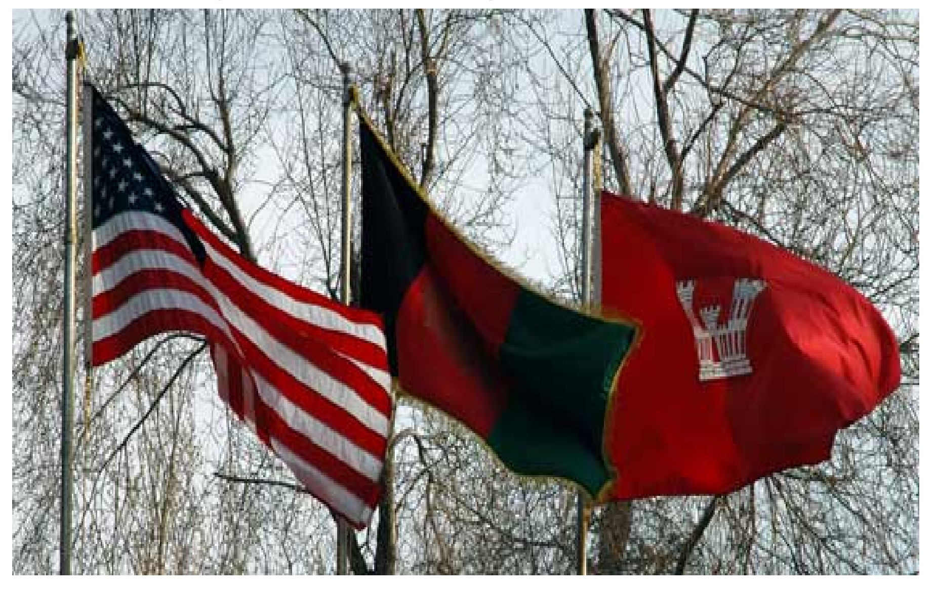
The Engineer Adventure of a Lifetime!