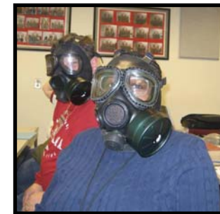
Training at UDC