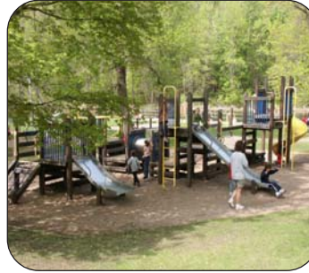
Playtime Excellence on Our Playgrounds