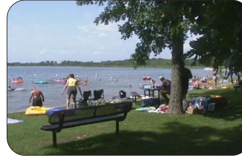
Fun on the Beach