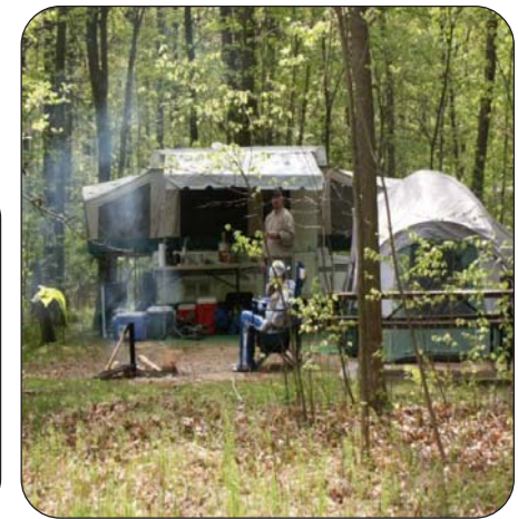
Quality Time around a Campfire